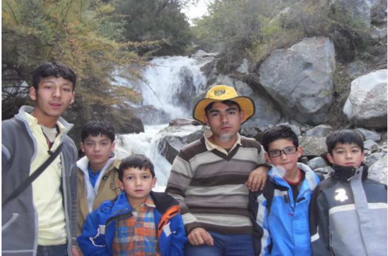
They were on hiking in Khane mountains;