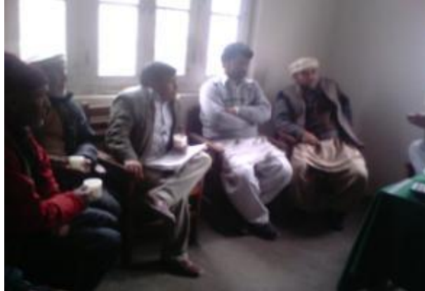
DDE talking with teachers and community members.