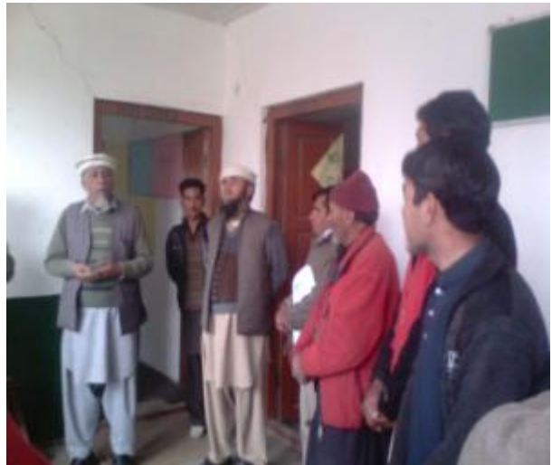
Deputy Director Education talking with Notables of Khane village.