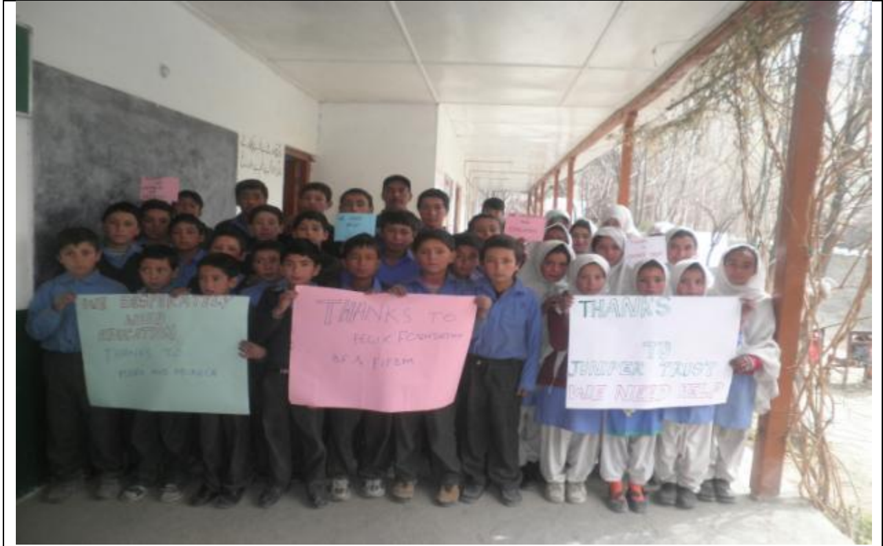
The students are thanking to Juniper Trust, and FIFBM&BF for the support to their education