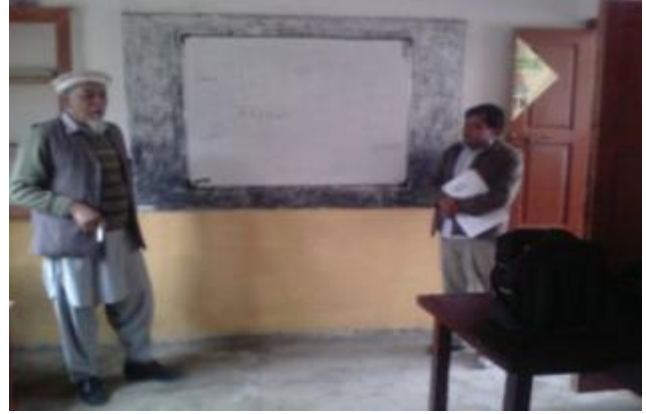
DDE giving a lecture to students in Class.